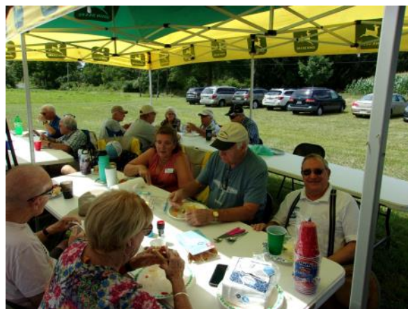
Chapter Picnic August 14, 2022