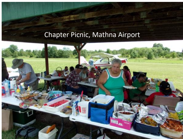
Chapter Picnic, Mathna Airport