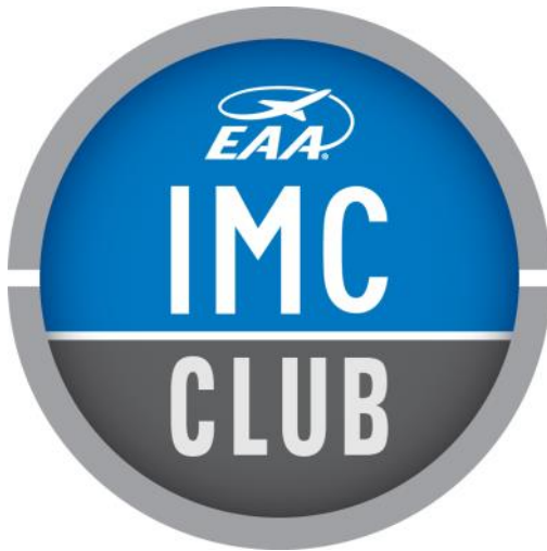
Sam Kistler Photos

No questions of the month were available at the time of publication