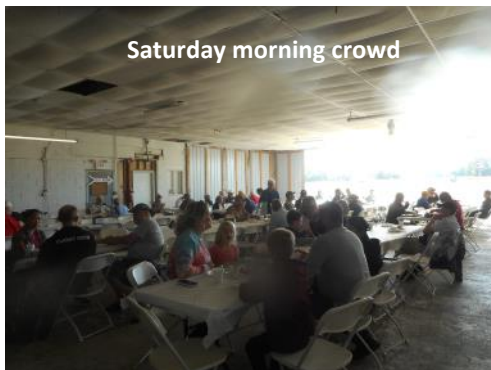
Saturday morning crowd