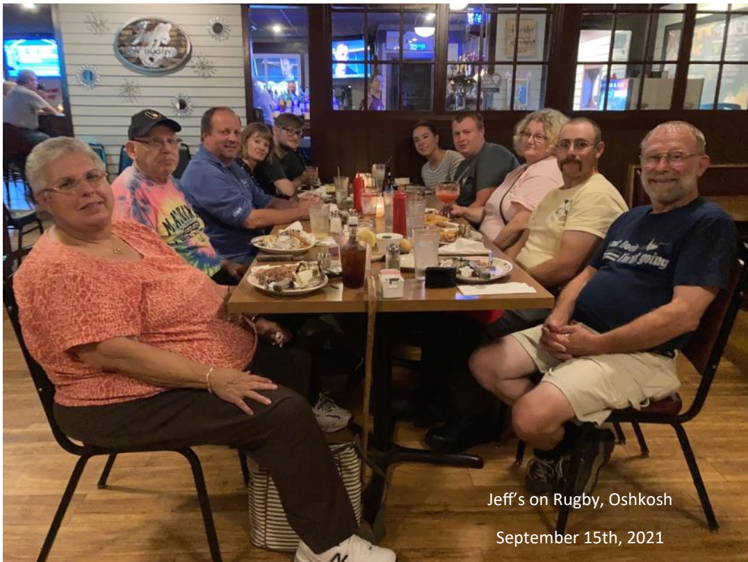
Jeff's on Rugby, Oshkosh