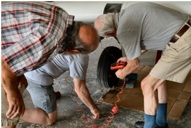
Checking for continuity

The Meeting will be held 10/9/2021 from 9:00 am to 10:30 am. Light refreshments provided