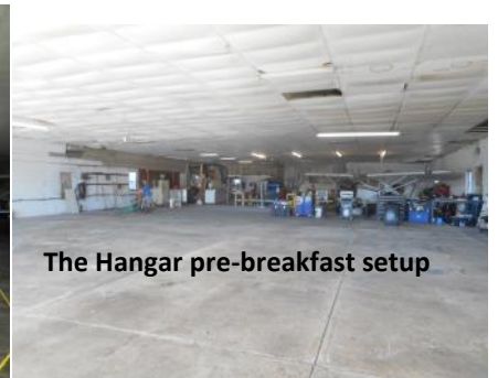
The Hangar pre-breakfast setup