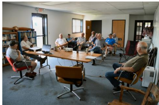
The gathering on 7/10/2021

Attention all members Please wear your Nametags to all chapter functions