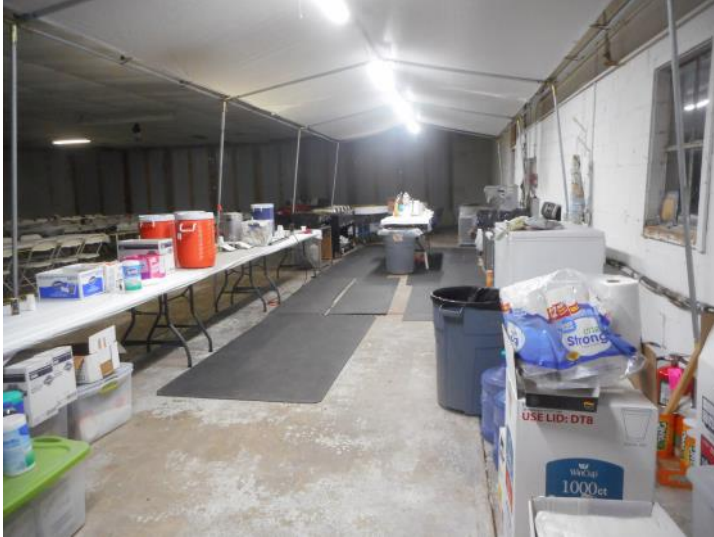
Calm before the storm. Early Sunday morning.