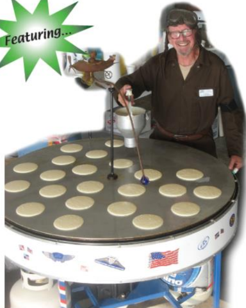
Floyd's Fabulous Flying Flapjack Machine!