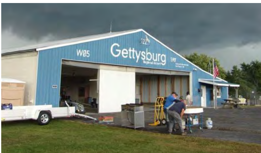
Bob trying to get the grills cleaned before the deluge came at the end of the fall Pancake Breakfast