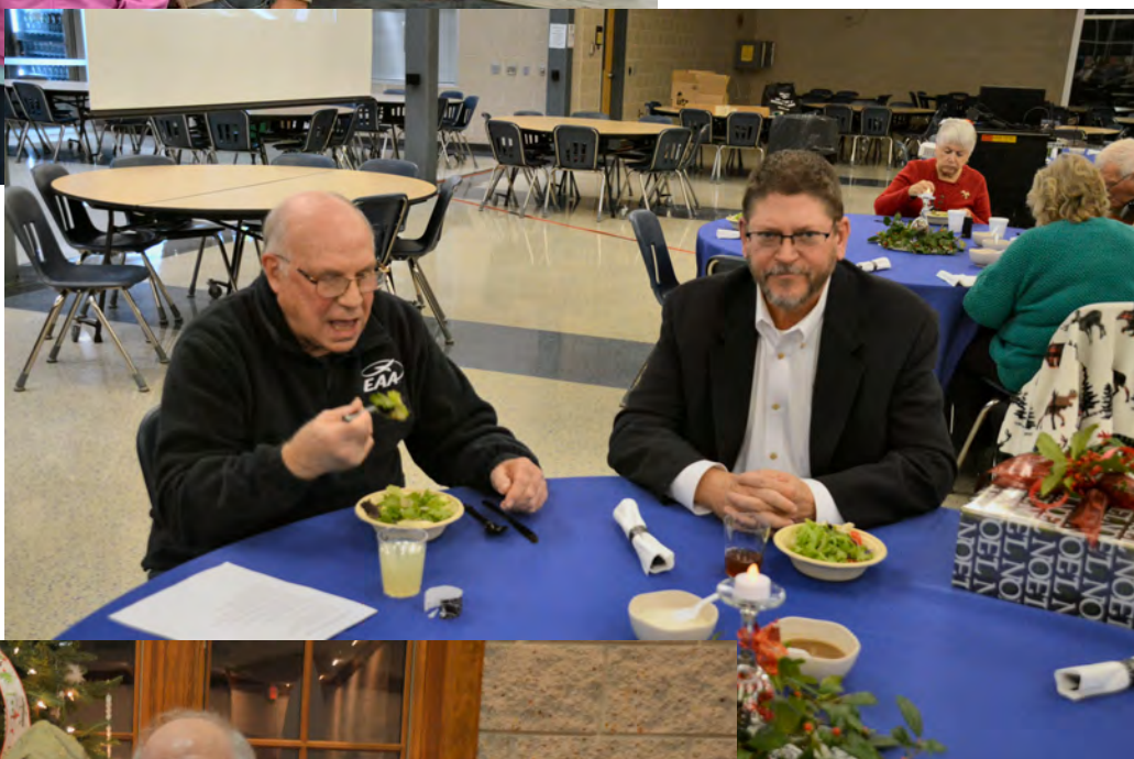
Chowing down at the 2021 Holiday Party