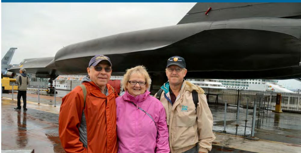
On the Carrier Intrepid (NY Harbor 2017)