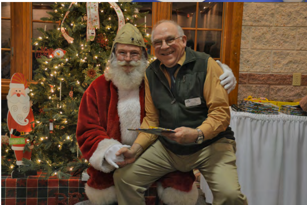
Sitting on Stormer Claus' lap!