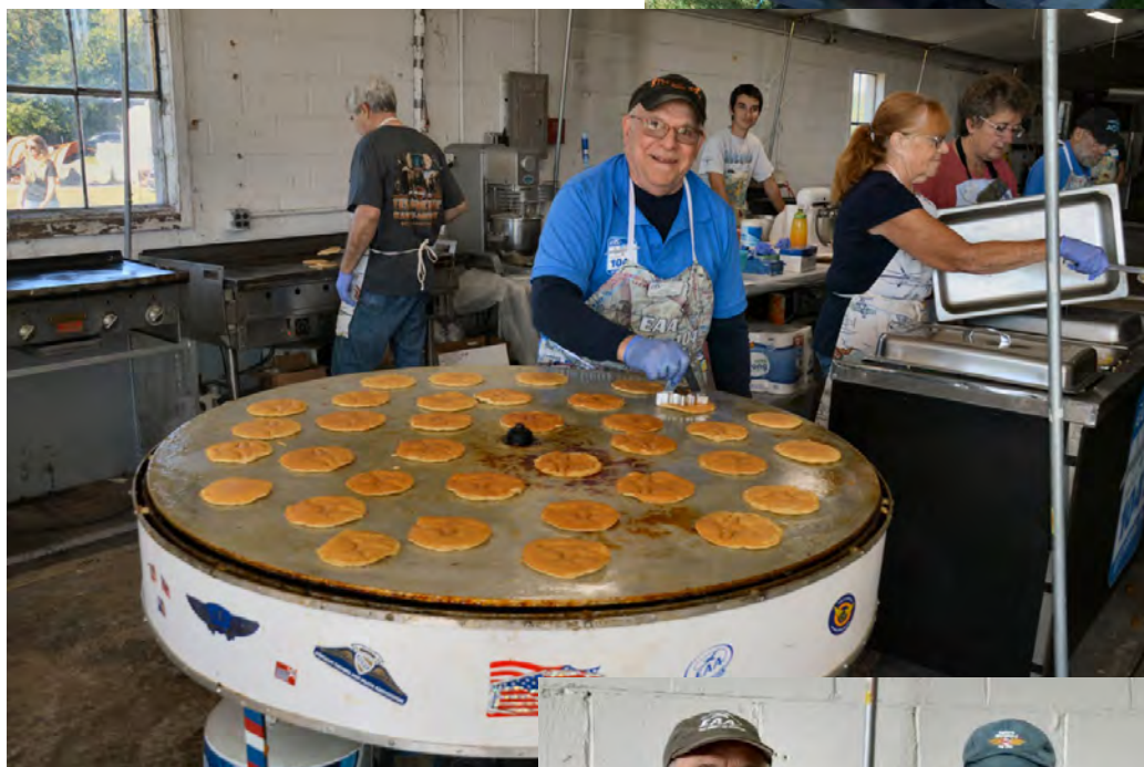
Flippin' the 'cakes at the Pancake Breakfast