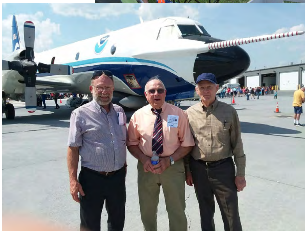
Posing in front of the NOAA jet