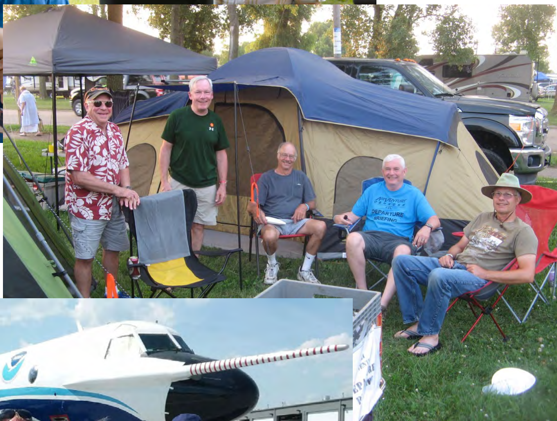
Camping! Guess where?