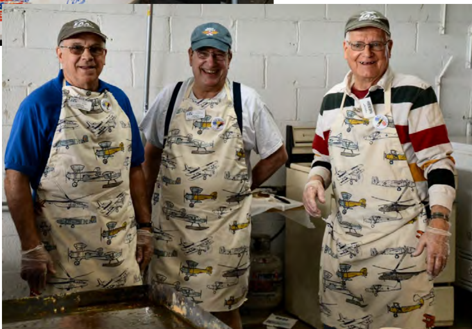
All dressed up with their 1041 aprons at the Pancake Breakfast!