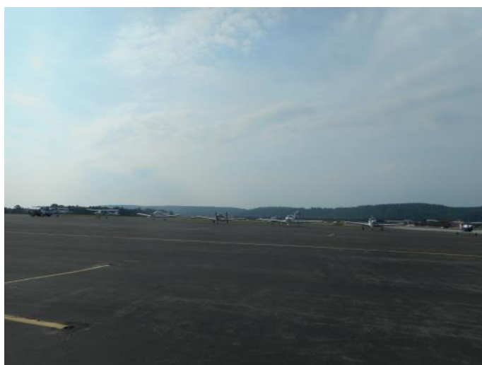
Young Eagles Flight Line.....8 aircraft