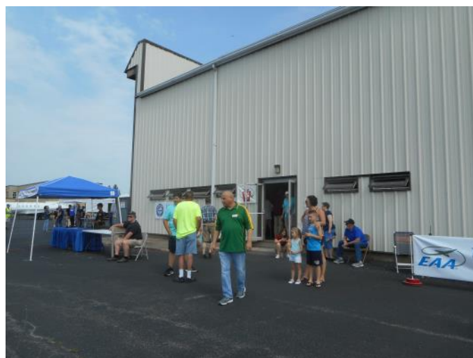
Waiting for Young Eagles Flights

Chapter 1041 pilots Savy, and Richard flew 18 Young Eagles from 10 AM to 2 PM