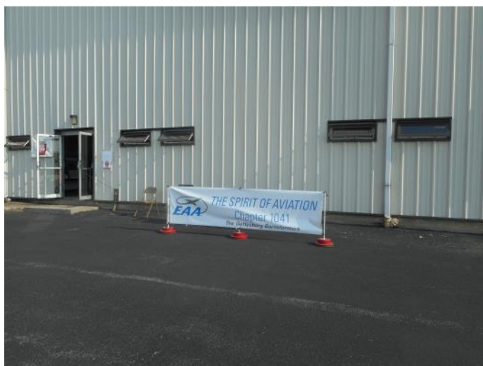
We set-up on the ramp in front of the Chapter 122 Hanger