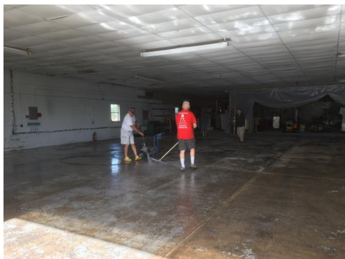
Power Washing Prior to Set-Up