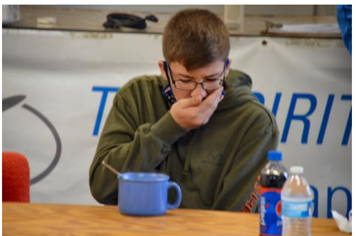
The Soup's too HOT!