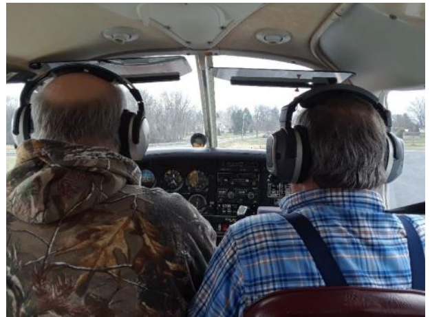
Art and Savy getting ready for flight