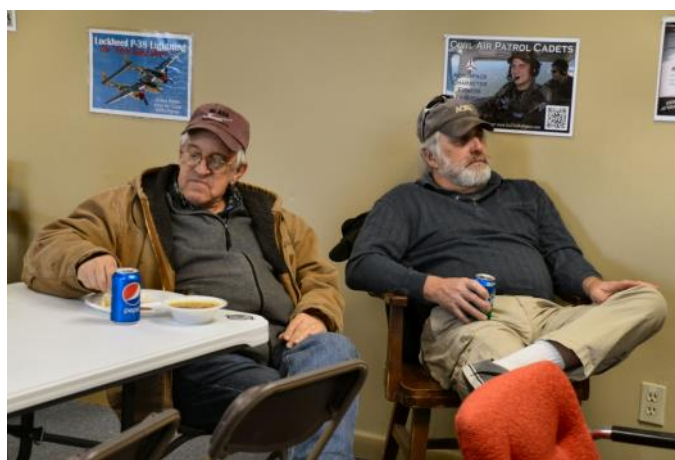
Last January's Soup-R-Sundae event