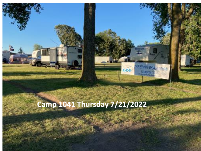
Camp 1041 Thursday 7/21/2022