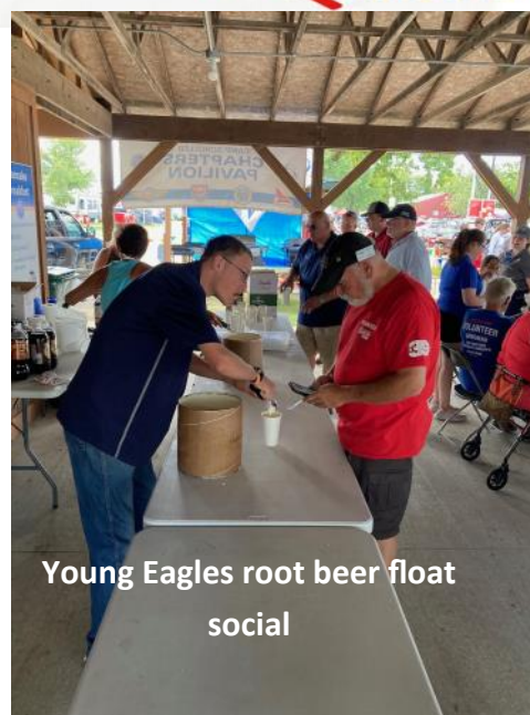
Young Eagles root beer float social