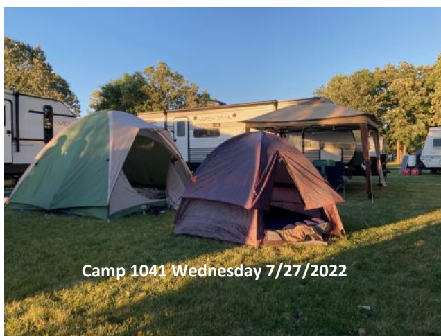
Camp 1041 Wednesday 7/27/2022