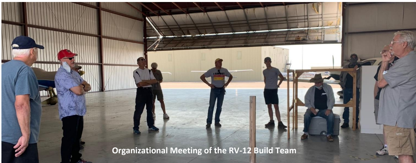
Organizational Meeting of the RV-12 Build Team