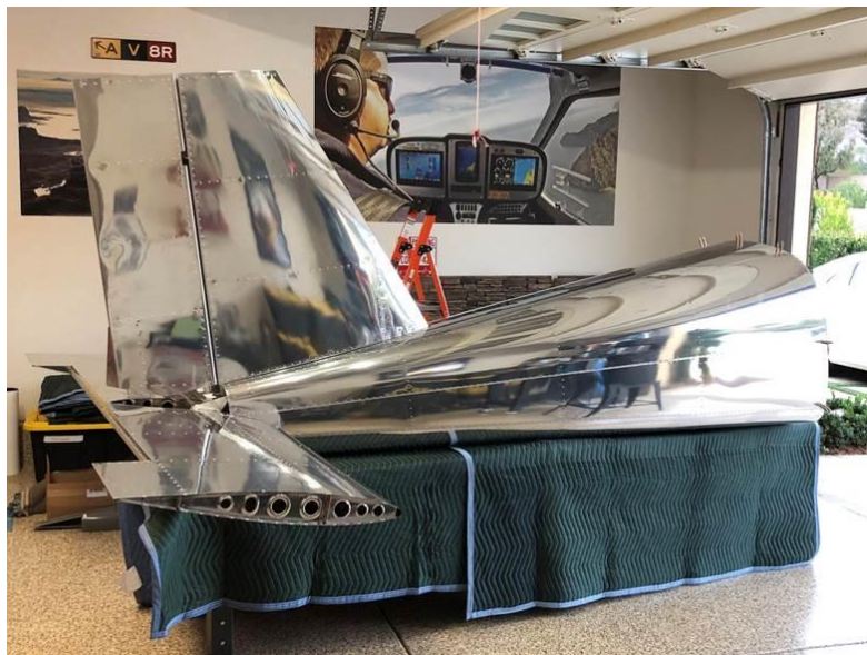
The enticement by CoffeyAviation on VAF Classifieds