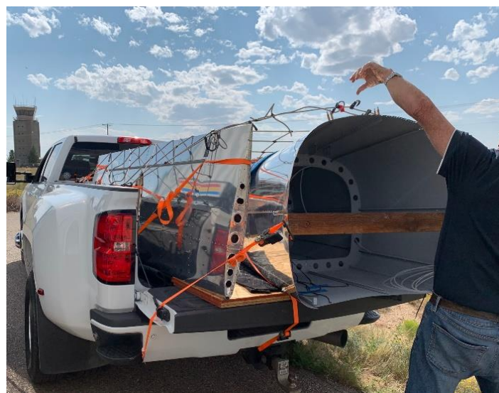
Over 800 mile special delivery, in 12 hours