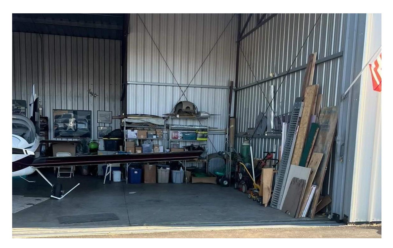
1. A very clean hangar!