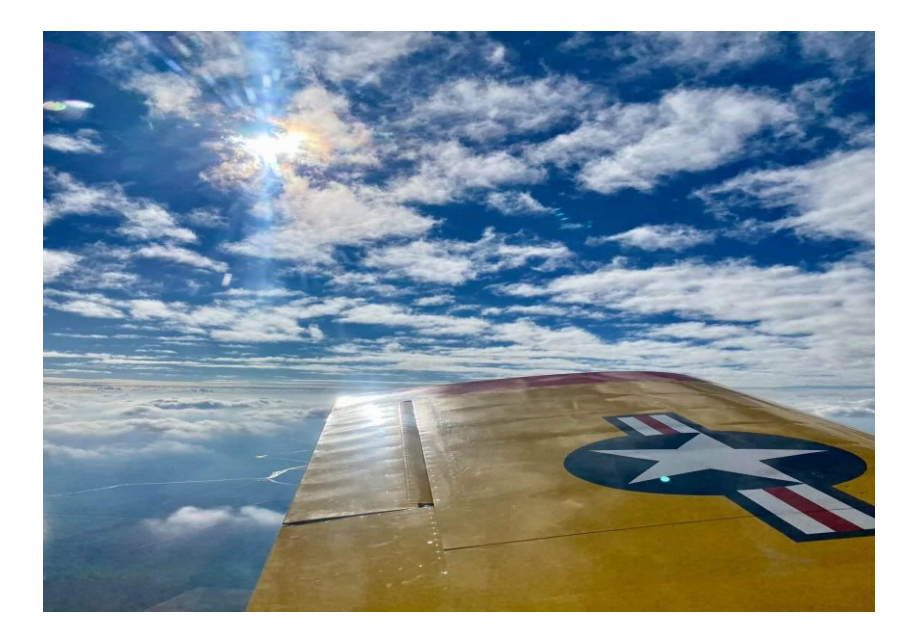
2. Rachel Long's view from the back of the RV-8, flown by Justin Frei.