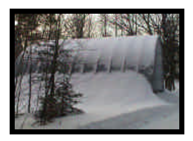
8 to 48 ft wide