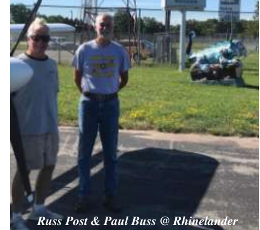
Oneida County Airport