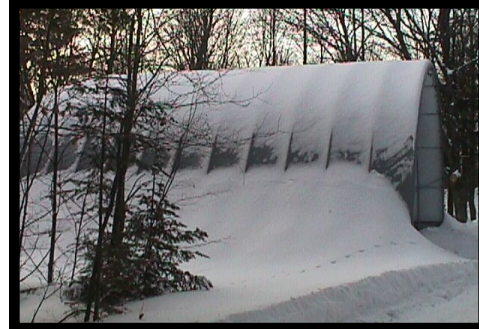
8 to 48 ft wide