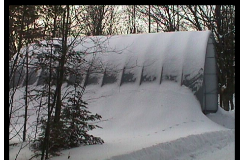
8 to 48 ft wide