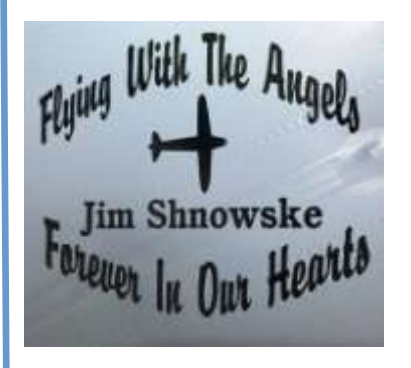
Jim Shnowske Tribute Decal

We are humbled to nounce these no cost 4 1/2 x 5 1/2 tribute decals are available in White or Black. Contact Steve Krueger at kruegerfly@aol.com or 715 204 2928 if you would like to receive your very own.