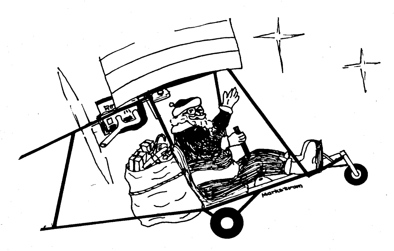
Merry Christmas to all -- and to all a good flight!