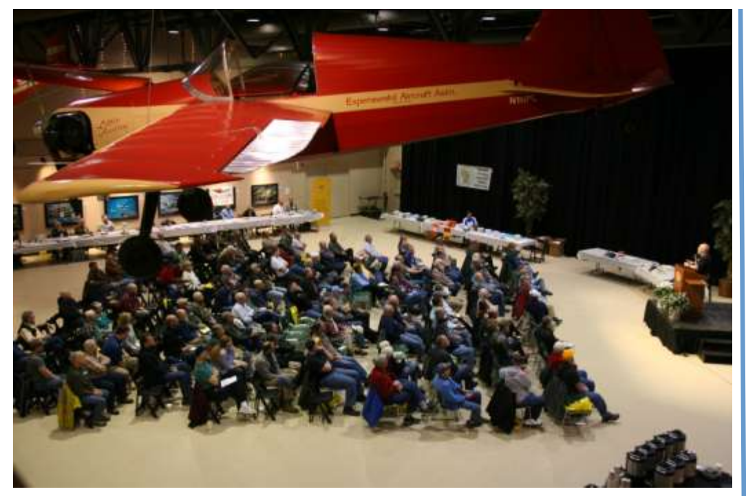
205 pilots attended this years 25th annual Aviation Safety Seminar held at EAA's AirVenture Museum's Founders Wing.

It was a great way to catch up with old friends and meet some new ones too.