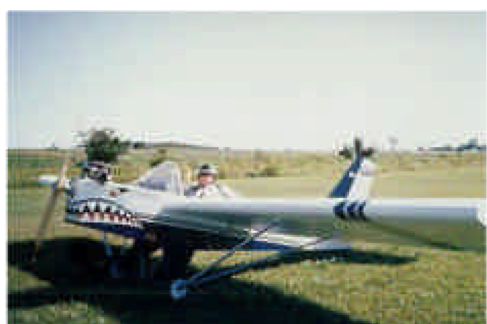
At Pioneer Day, find out who is on the rollout with the Mini Max