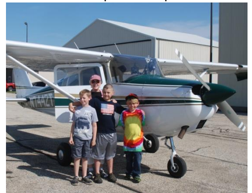
Gail's second group of excited youngsters