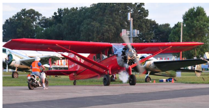
1929 Bellanca CH300 Pacemaker firing up