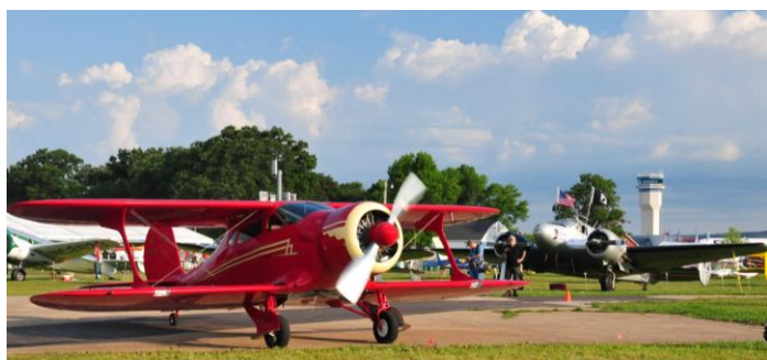
The view from our "home" on the grass taxiway to vintage camping