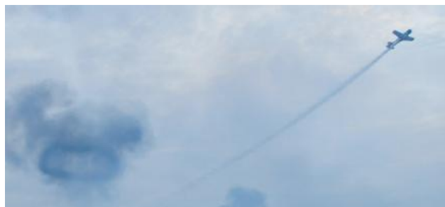
Tora! Tora! Tora! Air show where the smoke and haze obscured all but the sound of the Zeros

they saw the smoke and immediately landed, running for cover while a Japanese plane strafed the airfield.