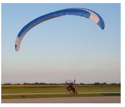
IAC Play Day at Curanda