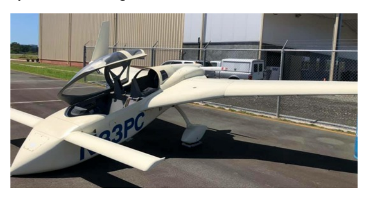
Hope to see everyone there!!