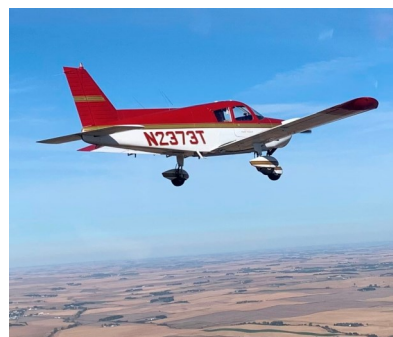
DOTSUWA looking pretty!