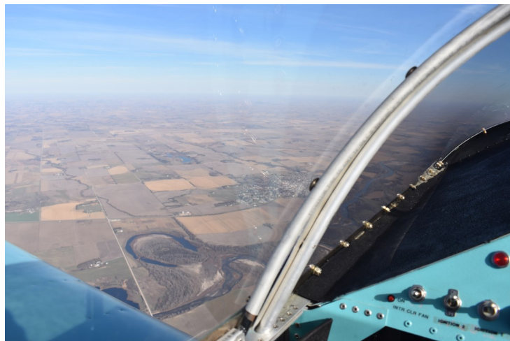
Out the window from 5,000' MSL in Jerry's Sonex, with Battlecreek just behind the windshield frame.