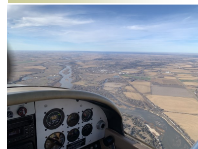
Loup River near Fullerton, NE, cruising southbound at 4000' MSL. Pretty day!