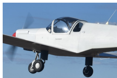
Tim Miller's Pazmany PL-1 up close and personal in flight.