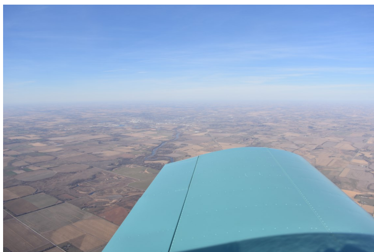
Left wing and Norfolk from 7,000' on recent test flight in the Sonex. Lots of power with the turbo, even high.