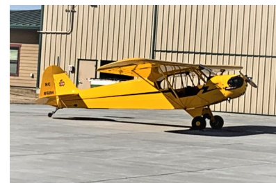
Saw this nice little J-3 Cub in Wayne. Cute, huh?