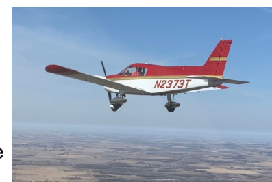
Here's DOTSUWA, heading home from Wayne. Smooth air, and good steady hand on the wheel make staying in position easy. Thanks!!