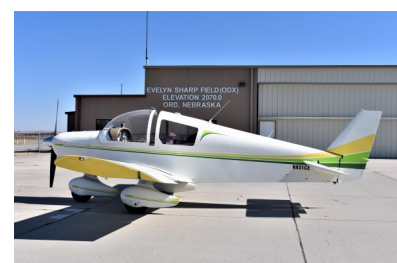
Research for Women in Aviation took me to Ord - Evelyn Sharp Field.