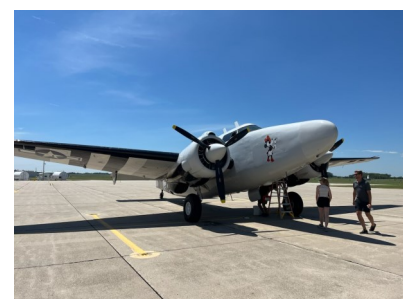
Lockheed Hudson/Ventura series were used as patrol bombers in WW2. The Howard company modified many after the war into executive transports. Another visitor to the Norfolk airport, heading home from the 'big show'. Always nice to see the unique and unusual on the ramp.