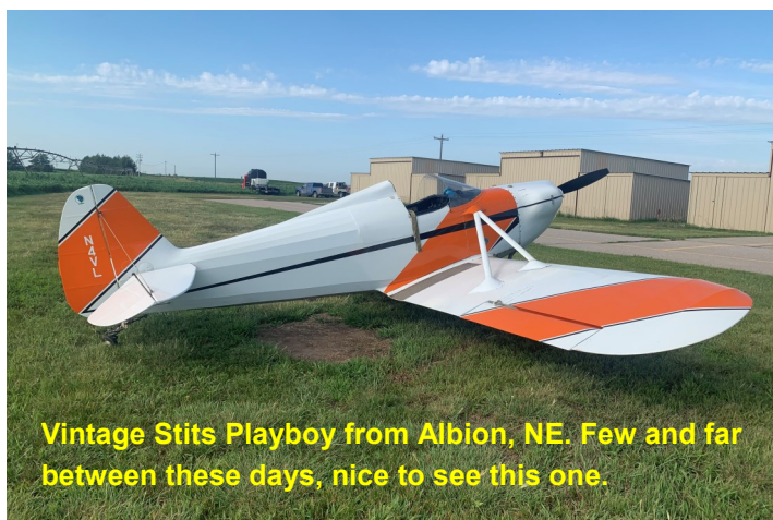
Vintage Stits Playboy from Albion, NE. Few and far between these days, nice to see this one.

A pretty morning this one, as the Zenith lifted into cool skies, headed southwest to Genoa (97Y). Smooth air made the trip comfortable and soon I was on final approach to the grass runway 11.