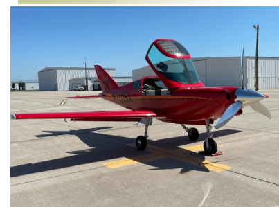
Swearingen SX-300 stopped in for fuel in Norfolk. Red, and red-hot fast the few that have been built still impress.