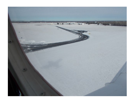
Short final to runway 32 following the GPS/RNAV approach. Nice work, Randy.