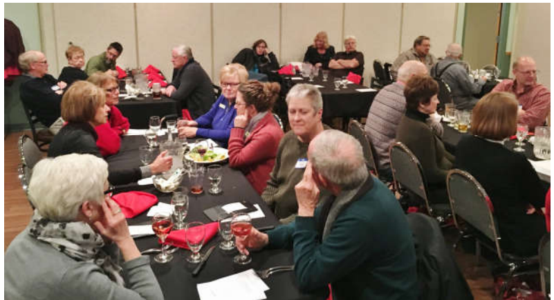
Nasty cold weather kept the crowd down somewhat, plus the "late-in-the-month" date conflicted with other events and family social gatherings. As noted, we have already reserved an earlier date for next year.