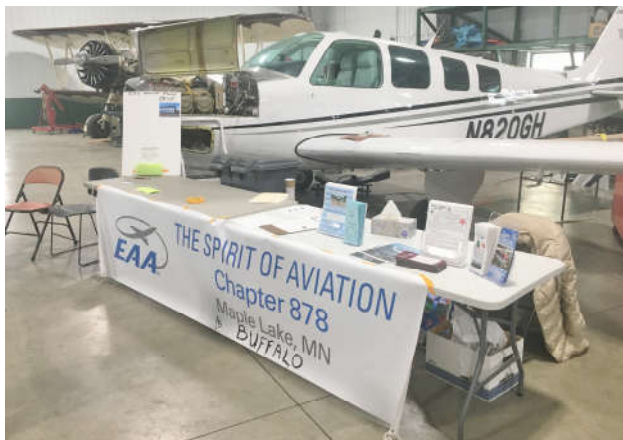
Chapter info display.