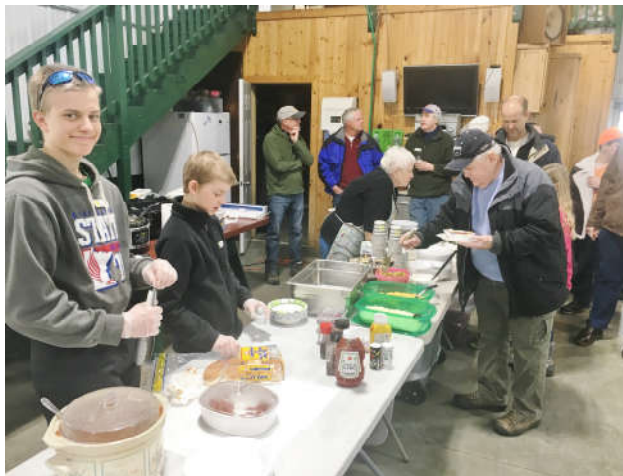
The serving line..."all you can eat" bowls of chili, baked potatoes with chili, and chili hot dogs.

Since the fly-in was held on the day we normally hold our monthly meeting, this photo recap will serve as the "minutes" of the day.