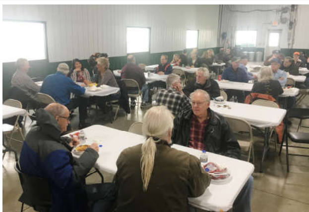
A good time to relax after a good meal!