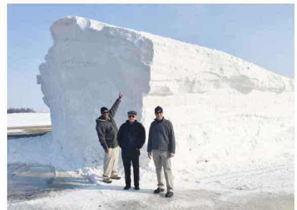
Thankfully the snow wasn't this deep across ALL of the Buffalo airport! The kid in me wanted to start digging tunnels and making forts!