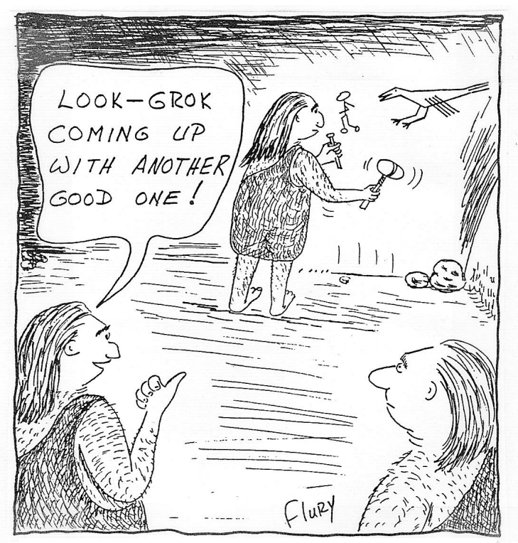
Prehistoric Aviation Cartoonist

Note: due to time constraints resulting from some personal issues that took a lot of time lately, this cartoon is a "repeat" from December, 1997.