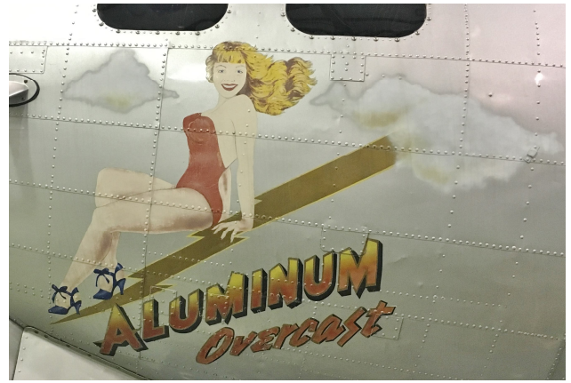
"Nose art" from the EAA's B-17G Flying Fortress, Aluminum Overcast . The EAA Museum currently has an exhibition of about 30 examples of nose art from World War II, all on actual segments of aircraft fuselages. Caution: not all of those displays are as family friendly as this one!