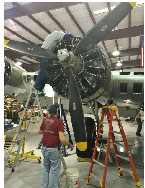
Not sure this is the OSHA approved (or even the AAF approved) way to access the plugs on #1 cylinder, but we did it! The mechanic on floor is unknown!