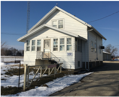
Our home-away-from-home for the weekend. Comfortable but tight accommodations for the 18 or 19 guys staying here, considering there is only one bathroom! Everyone shared nicely!