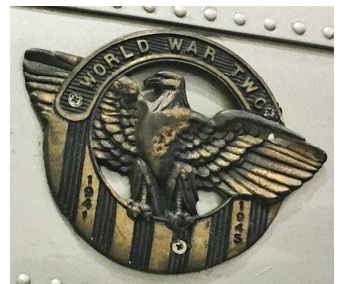
A commemorative plaque mounted on the left side of the B-17 fuselage.

The 2016 Great Minnesota Aviation Gathering, or GMAG, which is an annual major event of the Minnesota Pilots Association, has been set for Friday and Saturday, April 29-30, at the Anoka County – Blaine Airport at Golden Wings Air Museum. Mark your calendars for this event. Last year was great and this year should prove to be even better!