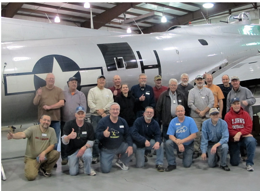
The whole work party crew!!