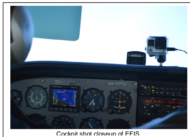
Cockpit shot closeup of EFIS

EAA intends to begin selling the STC as soon as possible, hopefully later this spring, at a nominal price point in line with its existing autofuel STC. In addition to the D10A, more products are actively being explored as EAA is willing to work with other manufacturers to bring down costs and reduce barriers to recreational flying. Stay tuned for more details!