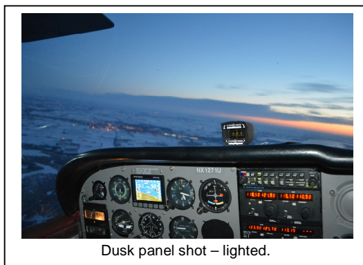
Dusk panel shot – lighted.