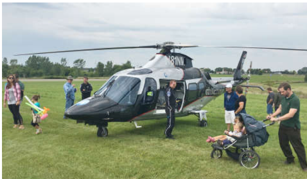
The crew of the North Memorial medical helicopter were kept busy answering questions.