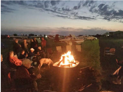
Friday night campfire at sunset, with blues music in the background.

"The Maple Lake airport was a very busy place on the weekend of September 9 & 10 as members of the Experimental Aircraft Association (EAA) Chapter 878 hosted their annual "fly-in." Pilots and non-pilots alike, along with families, converged on the airport for a Saturday night chili feed, live blues music, a bonfire and, for the adventurous, an overnight campout among the airplanes. Sunday's 31 st annual "Pork Chop Dinner" drew hungry folks from around the area. A variety of aircraft were available for viewing, information about aviation was provided, and several youngsters in the ages of 8 – 17 were registered for an upcoming "Young Eagles" airplane ride (a free introduction to flight). Next year's event will be September 8 & 9, 2018."