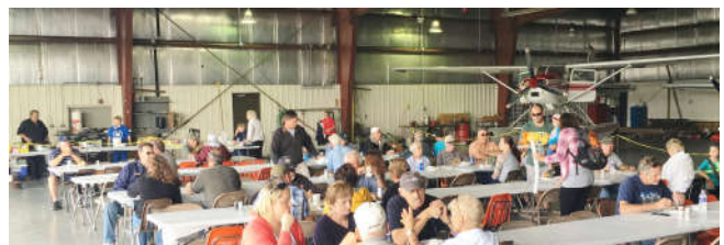
Folks hungry for a pork chop were satisfied!