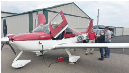
A visitor from the North. This display by representatives of Cirrus Aircraft was an attention getter.