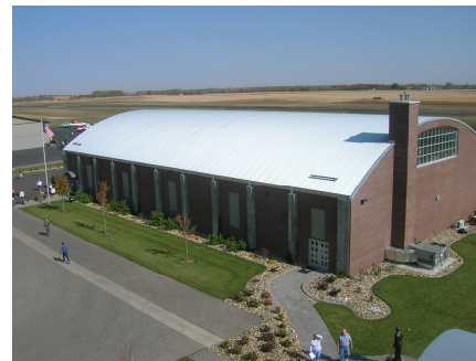
Left : the Fagen Museum WWII "Briefing Room" with statue of Col. Bud Anderson in front and the "control tower" behind; Above: view of the museum hangar from the control tower.