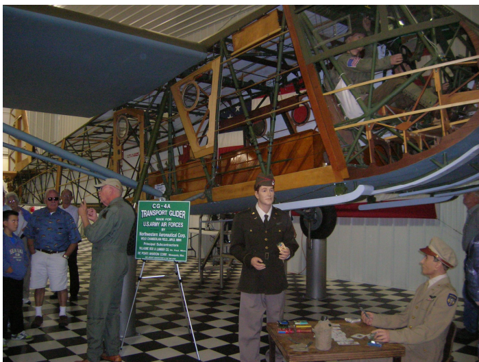
Left: a view of the Waco GC-4A Combat Glider which was recently restored by volunteers and is now on display at the Fagen WWII Museum.

Some of you may remember a chapter meeting in 2008 in Wayne Flury's "shed" when one of the volunteers on this restoration project, Ingemar Holm, came and gave us a presentation on that work. The chapter made a $200 donation and it was nice to see their results.