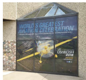
Near the museum entrance.