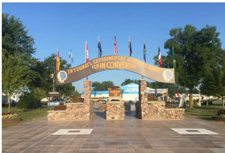
My yearly photo of the "Brown Arch," plus the surrounding patio where you can dedicate a paver to someone or something special in aviation.

Following are just a few of photos from the week. What did you see or do?