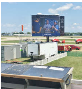
← Look who's on the Jumbotron!!