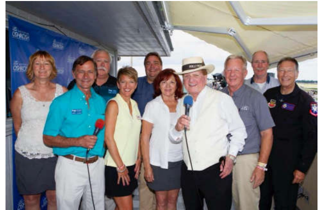
Group photo – the whole Announcer's Stand gang!