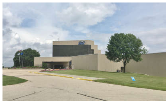
The EAA headquarters and museum, my traditional "first stop" after driving to Oshkosh.