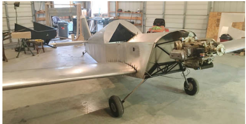
Da plane, da plane! (as of August 18)

The final result, as of August 18 and without too much mental anguish or loss of skin and blood, is something strongly resembling an airplane sitting in my shop with very solidly attached wings! 75% done and only 60% left to go!