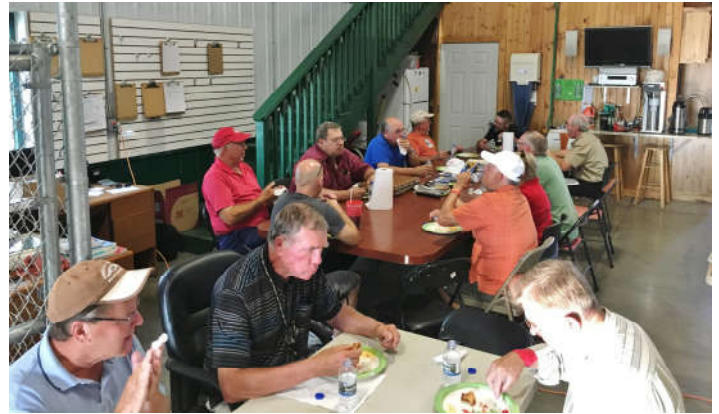
Chapter members and guests enjoyed a pre-meeting dinner.

Meeting called to order at approximately 7:10 p.m. with 20 members and guests in attendance.