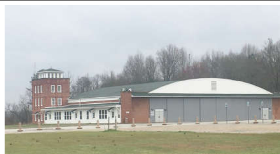
A “field level” view of Hangar No. 2 with a Control Tower at the back left hand corner. This site was originally named Moton Field and today is an active Alabama municipal airport.