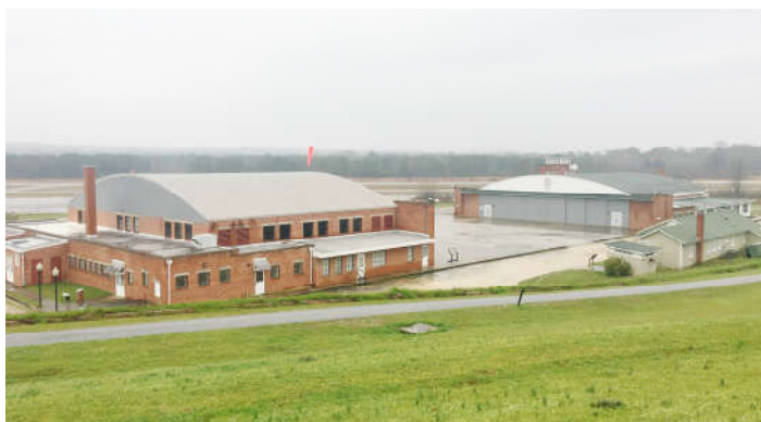
View of Hangars 1 and 2 from a hill at the main entrance, with a memorial walk and information. These were the hangars and classrooms for the airmen. I’ve too often thought of the Tuskegee Airmen as “just pilots,” but they were also mechanics and other support services as well...a black force within the Army Air Force.

We hung out in Nashville for a few days, toured the city, ate great BBQ (and here’s a shameless advertisement for the restaurant chain our daughter and son-in-law are associated with: Martin’s Bar-B-Que Joint, see: https://www.martinsbbqjoint.com/ ), went to the Grand Ole Opry, then to Auburn, Alabama to see our oldest granddaughter (she goes to a school there with a fairly decent football team, but who LOST to the Golden Gophers in a bowl game this year!), ate more good food, and then proceeded west.