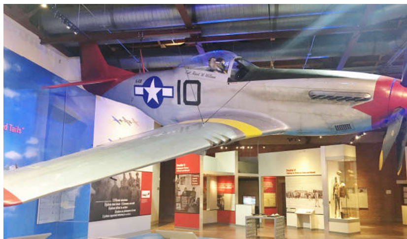
The Airmen actually flew many aircraft, but are best known for their “Red Tail” P-51’s (shown here is a replica) in which they achieved so much success. Hangar No. 2 has the majority of displays and a great film theater. Hangar No. 1 has a PT-17 and a Cub to represent Basic and Primary training.

Wandering through this museum, seeing the sites of our country’s history, and reading the stories of these men was both humbling and sorrowful while still conveying the achievements of the Airmen. Though not so long ago in time (1941 – 1945), I wonder how I would have reacted to the conditions of those days?