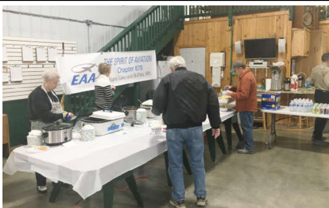
A table full of chili and cornbread ready for eating!