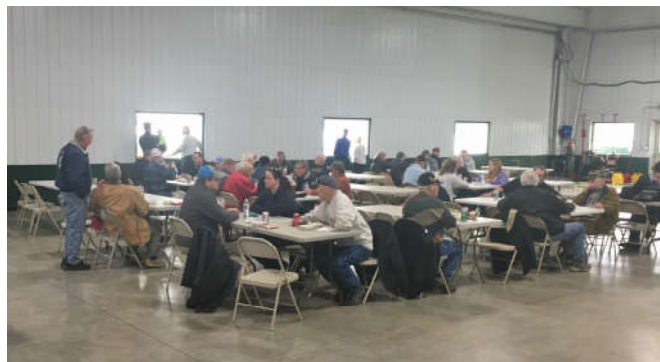
Happy eaters and talkers!

A financial report should be available at the March 14 meeting. Proceeds from this fly-in were earmarked for the Chapter 878 scholarship fund.