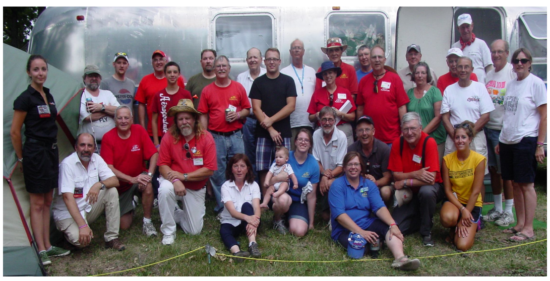
C/L Volunteer Picnic. I am 2<sup>nd</sup> from the left in the back row.

The remaining pictures are of some kids flying and also one dad (big kid) flying the airplane.