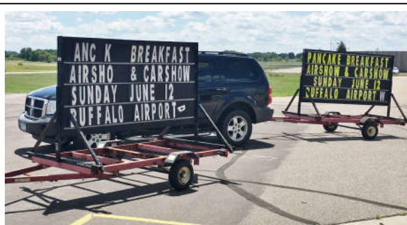
Sign trailers as originally received from West Metro Aviation earlier this summer.

If renting the trailers is approved by the chapter, a person (or persons) will need to organize and direct this effort. It will require advertizing, setting up contracts with the renters, establishing a rental price, monitoring the condition of the trailers, and general supervision of the program. We would also need to be sure we are in compliance with any regulations regarding rentals of such equipment.