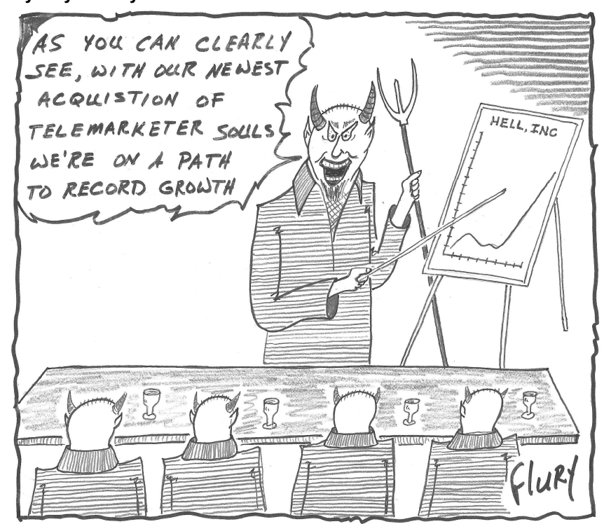
What we all hope is true.