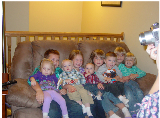
It's not easy to get a good picture of the grandchildren, but this one turned out pretty good.