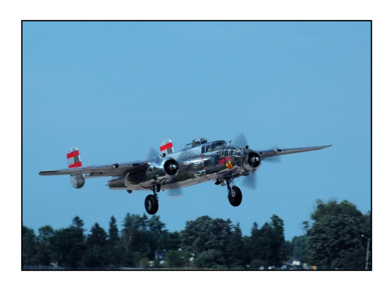
The Boeing B-17G Flying Fortress was represented by EAA's "Aluminum Overcast." Also, the medium class bombers were there, one of which was the North American B-25 Mitchell "Panchito" on the right.