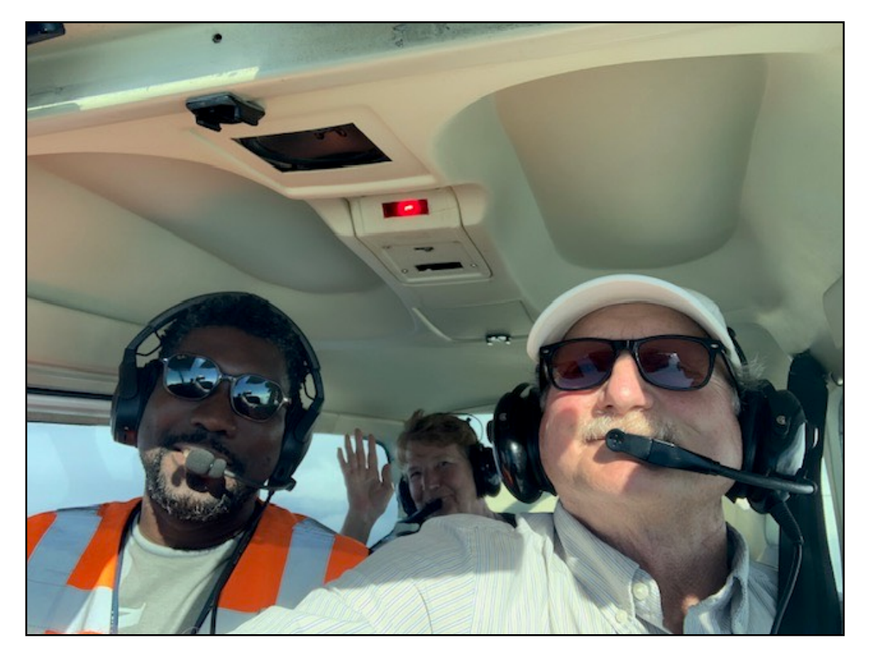
On top @ 8000' on our way to Aruba.

My wife and I were fortunate enough to spend February in the ABC islands. These islands are Aruba, Curacao, and Bonaire and they are about 50 miles off the coast of Venezuela. We were able to spend a week or so on each island, and while each is unique in Its own way, Bonaire was my favorite. It offered many opportunities for snorkeling, diving and kitesurfing. I started my kitesurfing lessons last year in Mexico, but this year I was finally able to stand up on the board and go for a little while on the board. I hope to continue with my lessons next year. These islands are north of the equator but south of hurricane alley and benefit from consistently nice weather and prevailing easterly winds. There are two local air carriers that offer inter-island flights departing hourly every day. I thought it would be no problem getting a flight from Bonaire to Aruba if I booked it as soon as we arrive in Bonaire. WRONG! It turns out that both local carriers were totally booked for the whole week because of carnival. After talking to some of the local pilots, I found one it was willing to charter his 172 Cessna. Although it was quite pricey we had our lodging in Aruba already paid for and did not have any other option. In the end, it was well worth it because he let me fly the airplane and log and unforgettable memory.