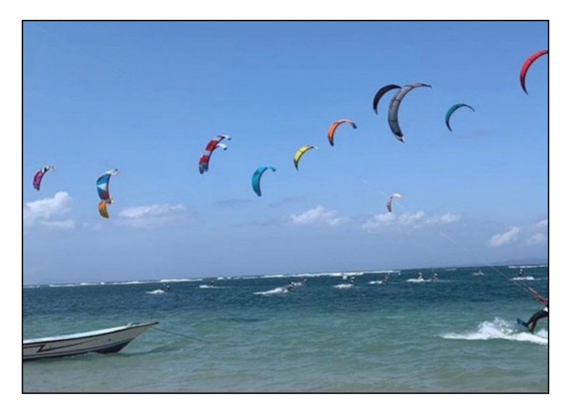
Kitesurfing is not as easy as it looks, but I was glad my instructor had a boat to come and chase me down.