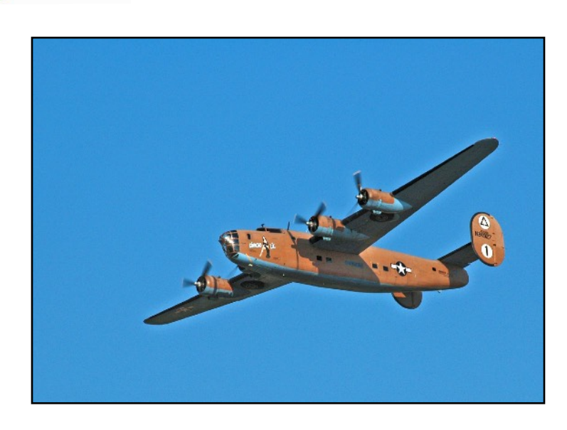
AirVenture 2006 featured the Theme "Big Bomber Reunion" so, at the upper left is the only flying British AVRO Lancaster bomber in North America. On the Right is the Consolidated B-24 Liberator "Diamond Lil."