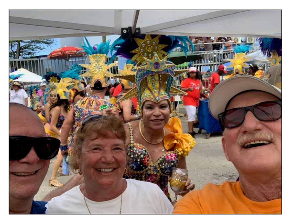
Having a good time at Carnival, with some of the locals that we met during the six hour parade. What a party!