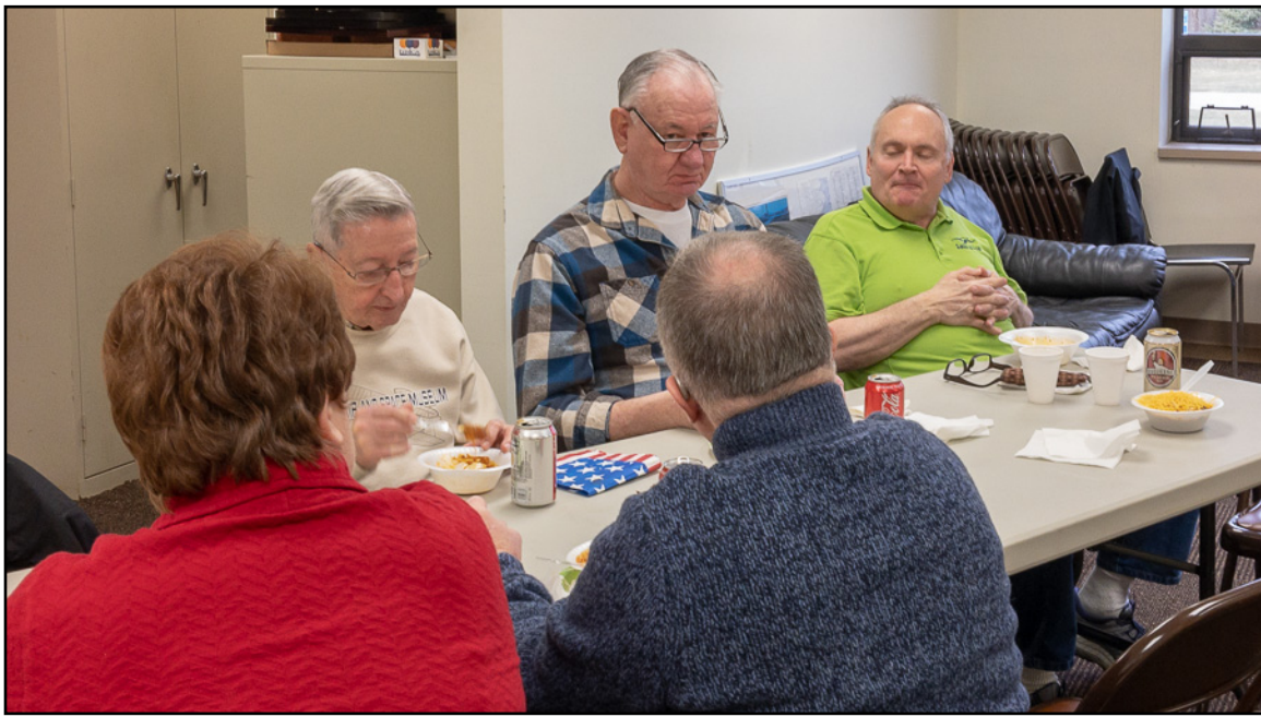
Post Super Bowl Chili Bowl at KBTP