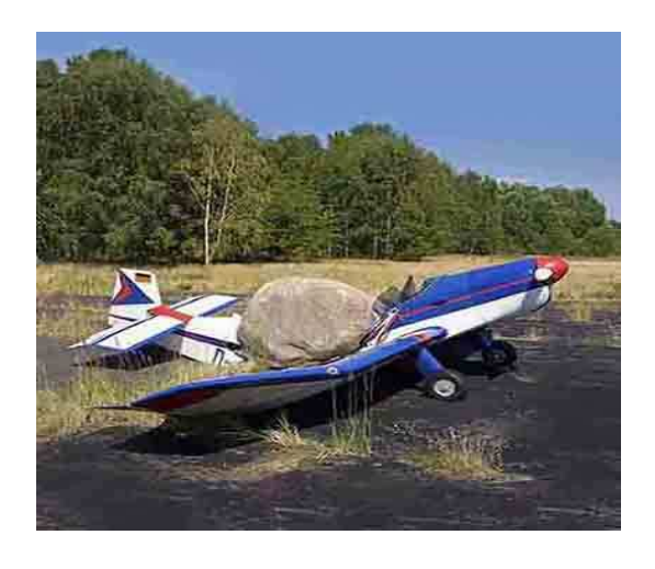
Always get the Backhoe in the divorce...

EAA 797 Morning Fly-In Pancake Breakfast Is on September 16, 2023