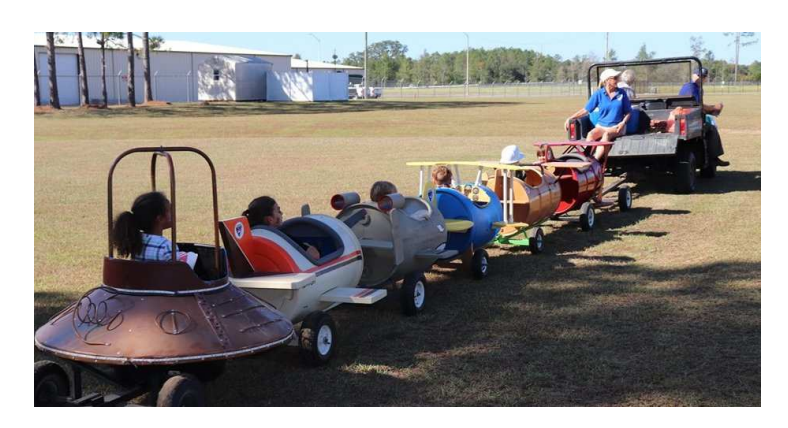
Kiddie planes are a hit wherever we go.

Chapter 797 showed up for the community once again for the Suwannee Valley Electric Co-op's very public event. By consistently appearing at community events, Chapter 797 is becoming a Live Oak personality.