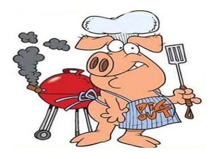
Pig Roast 10/19/2019

The monthly meeting will not be held at the Chapter Building this month. At. 11:30 AM. On October 19<sup>th</sup>, 2019, A Pig Roast will be at held instead. All of our members are asked to share in the fun.