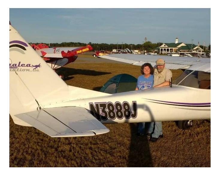
Tina & I at Thomasville

Tina & I did our first fly-out and camp flight. The ground was hard as a rock, there didn't seem to be anything to do once the sun set and there wasn't any ATM. No matter, we flew there. That's cool all by itself. They have a simple and active event, but if they want to promote campers to stay they might want to plan some activities. There needs to be a meeting place for the hangar flying. Maybe a bonfire, fire pit? Just someplace to act as a nexus.