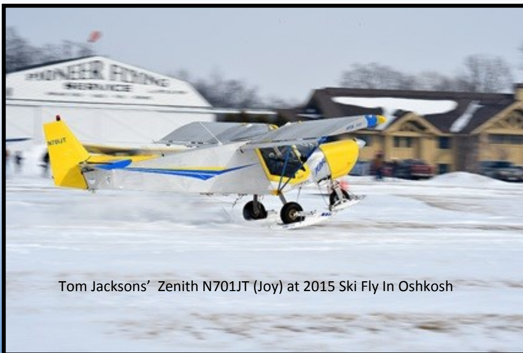
Tom Jackson's Zenith N701JT (Joy) at 2015 Ski Fly In Oshkosh