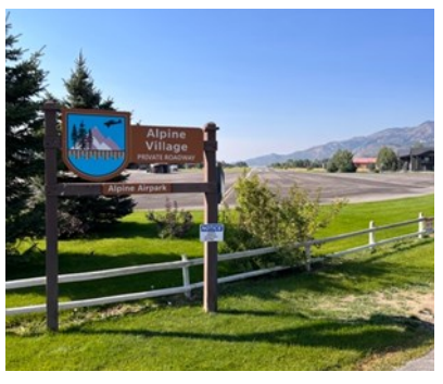
Alpine Airpark in WY, wonderful!

(KGWS) which is surrounded by mountains. It was nothing special from an airport service operation perspective, but it would be mighty fun to fly in and out of that airport!