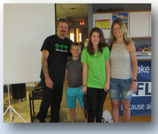
A Young Eagle Flight