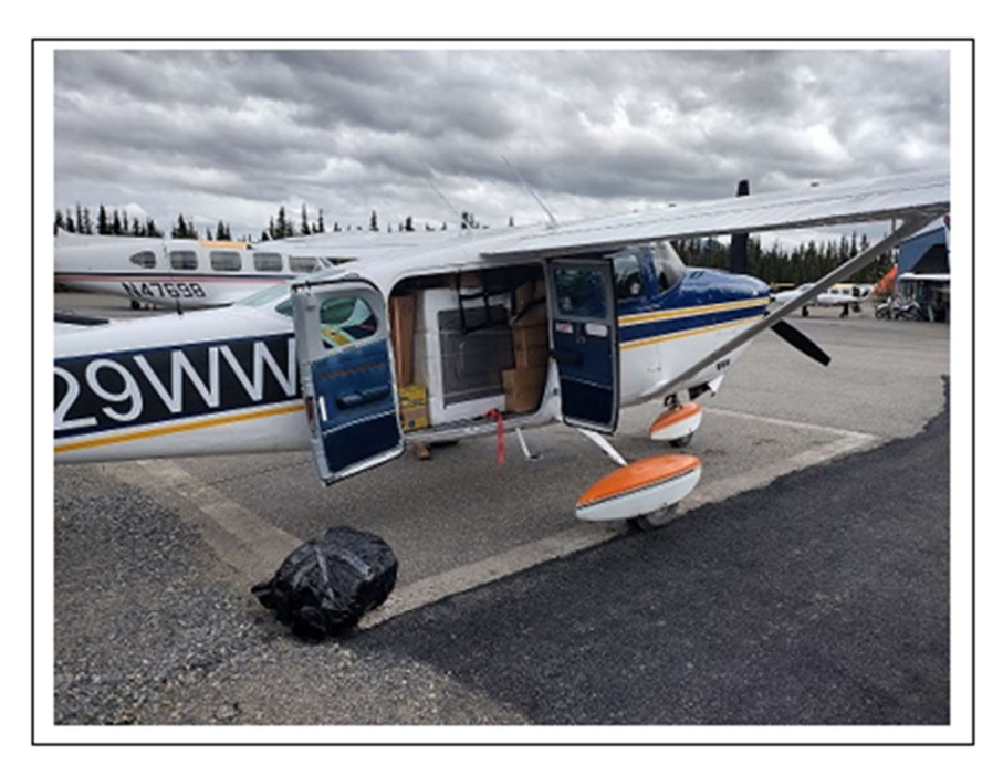
WW loaded with typical load of cargo – usually load is about 1200 pounds including me. Does not include the fuel load either! This Time I did not have to take the Co-pilot seat out. Alternately would carry 6 passengers.