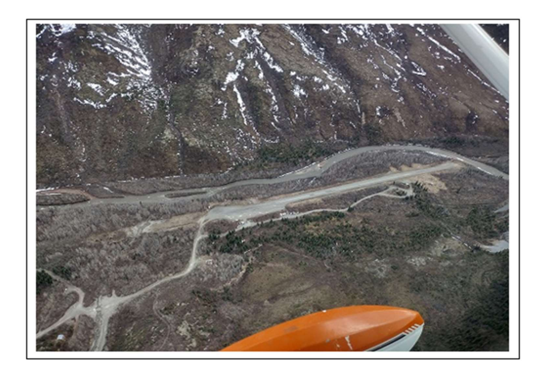
The destination – Kantishna Air Strip (5Z5) – 1800 feet of gravel. Uphill from right to left. Therefore, in a fully loaded 206 you try to land right to left unless there is a wind of 15 or greater from the right. Takeoffs are left to right – downhill! Oh! And watch out for moose, bear, or other wildlife!