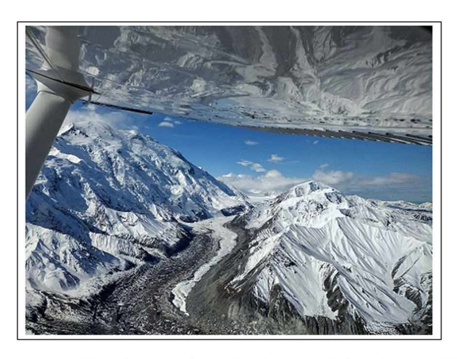
Looking SW up the Muldrow Glacier towards Denali. Wickersham Wall of Denali is center left. When flying guests to the Lodges we served, weather permitting, we would amend the route to do some flightseeing like this view.