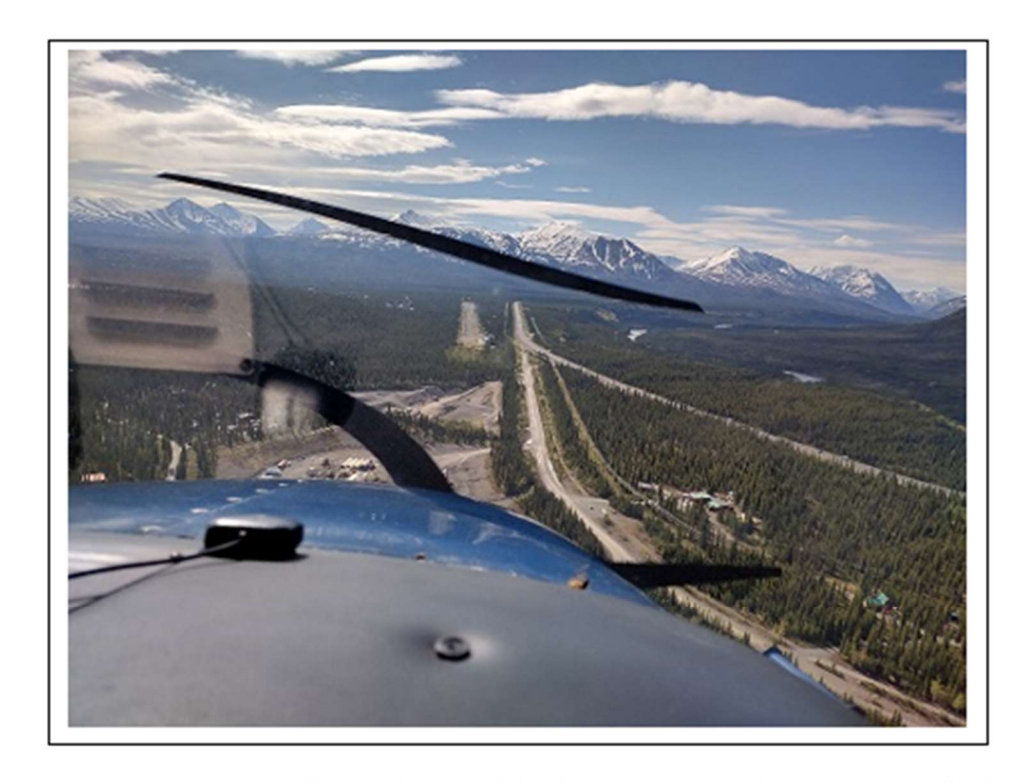
Final approach to home base, Denali Private (AK06), just to the left of the Parks Highway. Downwind takeoff or landing – yes – almost <u>everyday</u>. It <u>is located in</u> 'Windy Pass'. And they <u>call</u> 'Windy' for a reason!