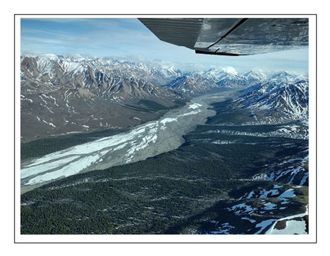
Toklat River – Looking south towards the Alaska Range from Mt. Sheldon area.