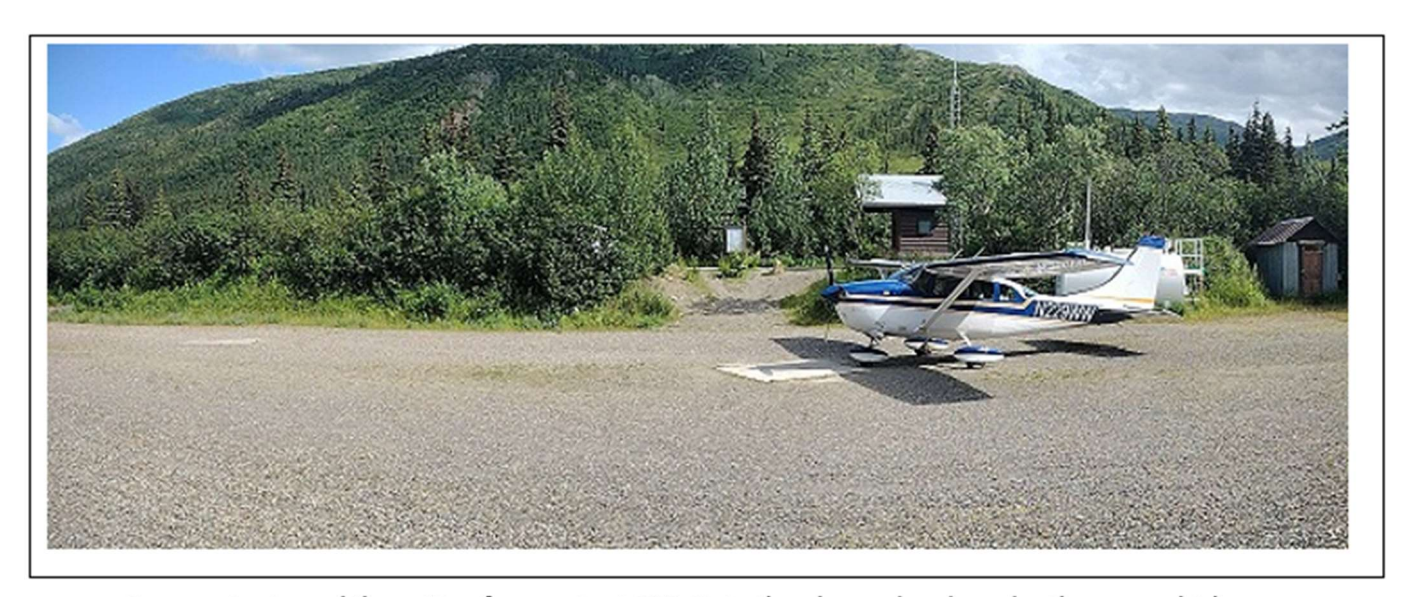
Panoramic view while waiting for guests at 5Z5. Note the plywood pads under the prop which helps prevent stone nicks.