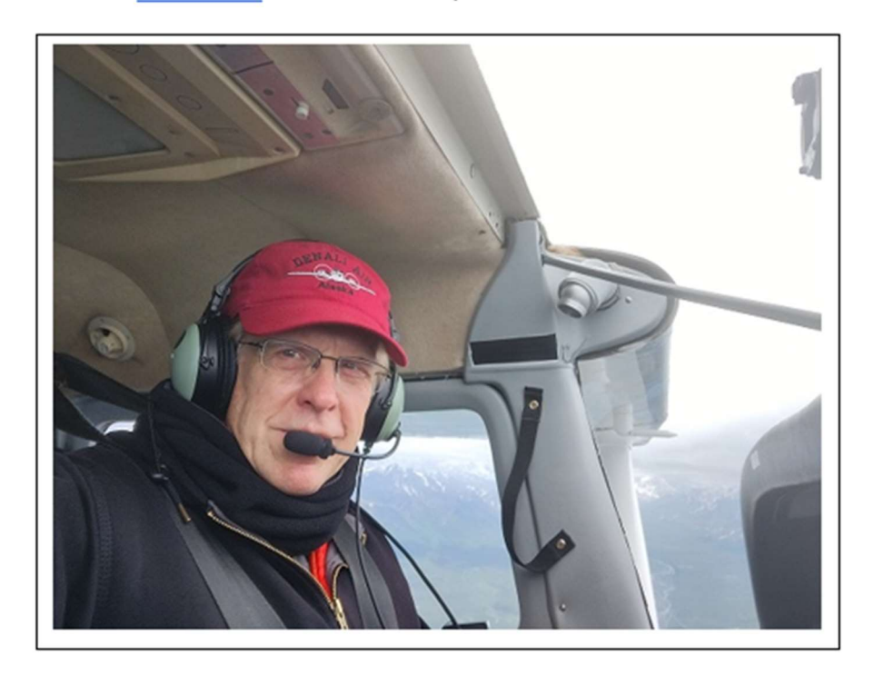
Just another day in the office.