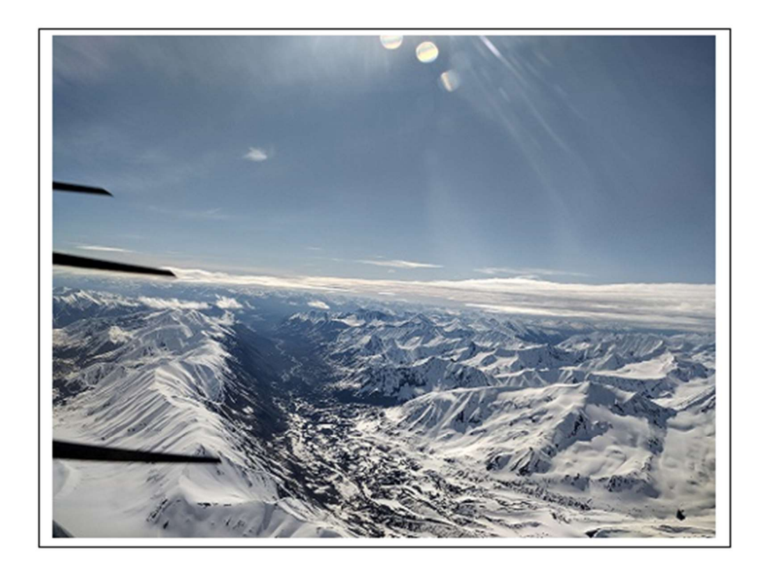
Returning to base, Denali Private (AK06), following 'The Trench'. <u>View</u> is NE from about Anderson Pass. Pacific Geological Plate on the right and the North American Plate on the left.