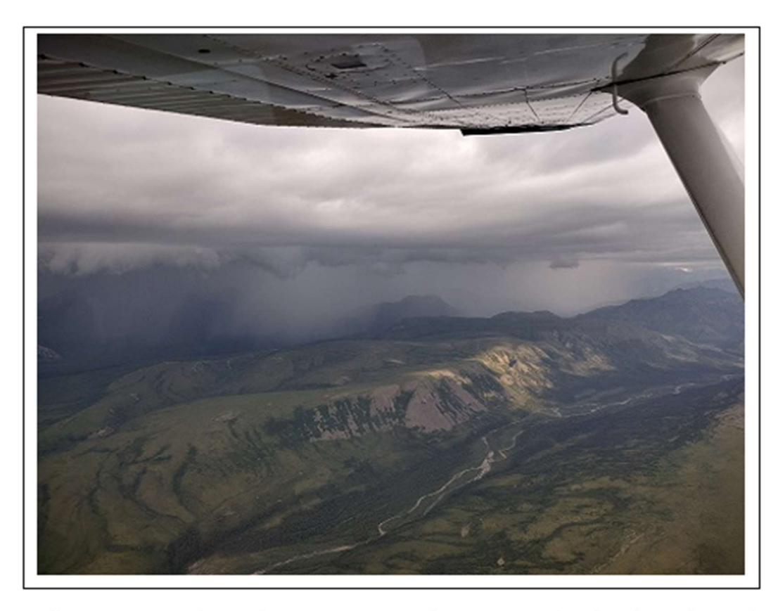
It's not all CAVU. So, you better know your terrain from <u>tree</u> top level and up. This is Class G <u>minimums</u> and we certainly flew those minimums.