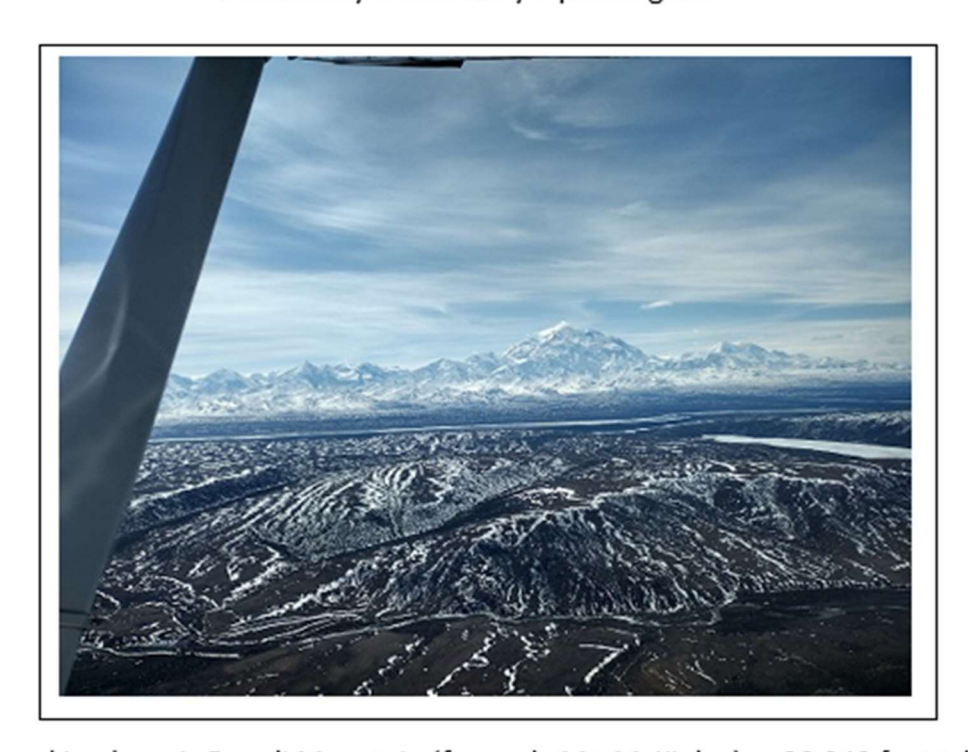
Centered in photo is Denali Mountain (formerly Mt. McKinley) at 20,340 feet tall.