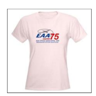
Men's Polo and Women's T-Shirt

Many items are available from CafePress (www.cafepress.com),