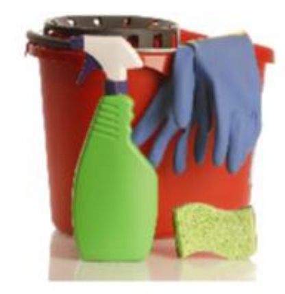
*Perfect Detail is a spray-on / wipe-off product that provides an added wax-like finish to the paint.