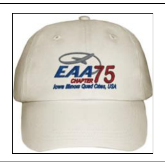
Baseball Cap in Light Khaki

You can visit the Chapter 75 store by going to www.cafepress.com/eaachapter75. All items are shipped directly to the buyer. All you need is a credit